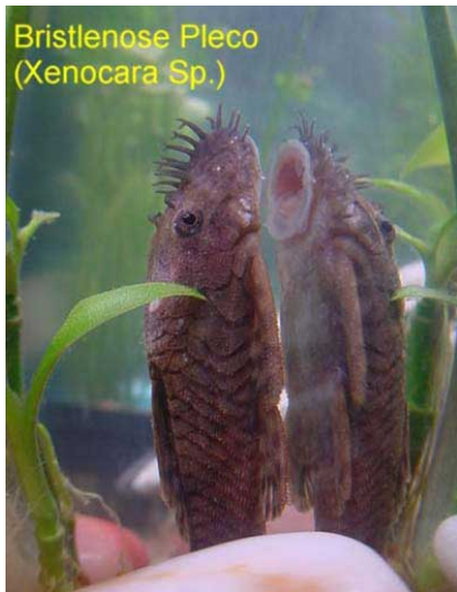
Bristlenose Pleco (Xenocara Sp.)